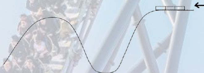
Figure 1 shows the first two hills of the Big Dipper with the train about to go down the first drop.