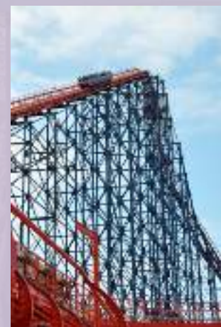
Figure 2 shows The Big One train being pulled up to the top of the first drop