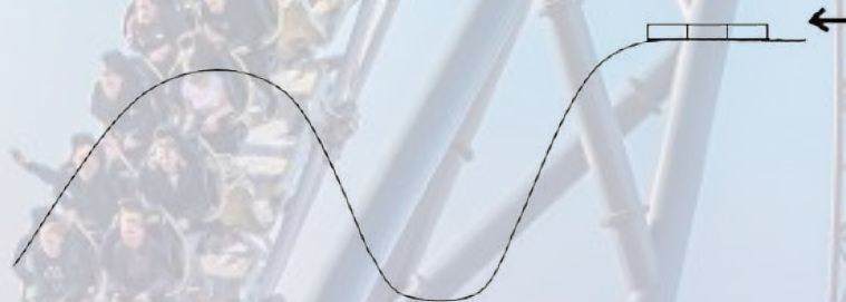
Figure 1 shows the first two hills of the Big Dipper with the train about to go down the first drop.